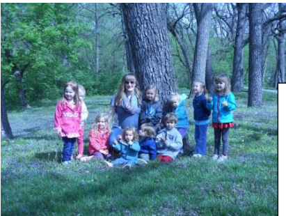
Arbor Day was celebrated with Story Time at the Park.