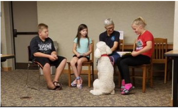
Morgan, the service dog, heard over 100 children read to her.