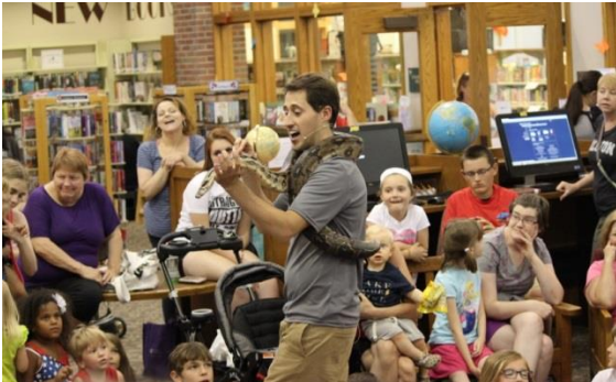
Summer Reading with Wildlife Encounters