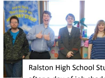
Ralston High School Students after a day of job shadowing.