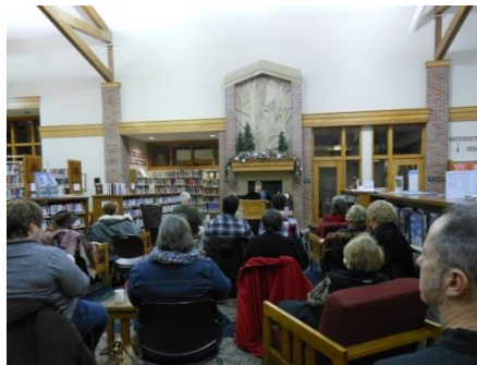
Words on the Winter Wind were heard despite the truck rolling into the north wall.