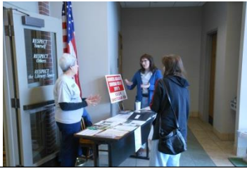
Gardening Tips at Seed Share