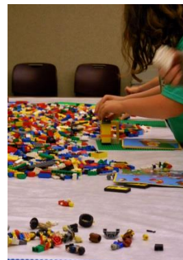
Building with Legos enhances brain function for reading. Lego Club meets weekly.